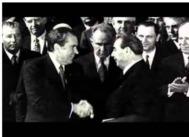
US President Richard Nixon and General Secretary of the Communist Party of the Soviet Union Leonid Brezhnev met at Moscow (1972)

Richard Nixon and General Secretary of the Communist Party of the Soviet Union Leonid Brezhnev met at Moscow. This meeting was significant as it began the process of reduction of tensions. An important agreement was signed to limit the nuclear missiles that the two countries had. The 1972 Moscow summit meeting signaled the beginning of the era of détente. Détente means reduction of tensions. The United States and the Soviet Union tried to reduce tensions between themselves.