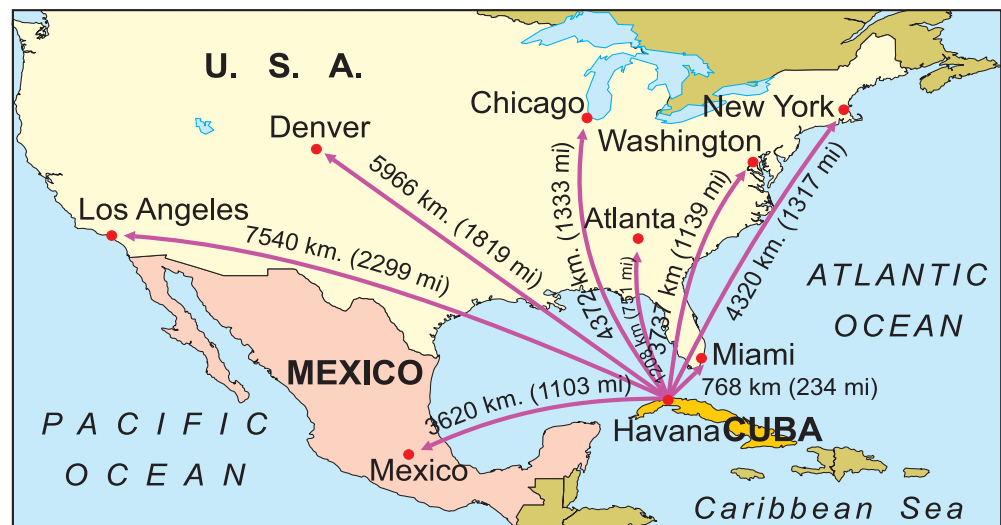
Location of Cuba vis a vis United States

In 1962 came the Cuban Missile Crisis. This was one of the most significant events of the cold war. Soviet Union placed missiles in Cuba that were a direct threat to the United States. Americans retaliated with a naval blockade of Cuba. This was the first direct confrontation between the cold war rivals. For the first time since 1945 American and Soviet naval ships faced each other and there was a real possibility of a war. It was feared that such a war would be a nuclear war. This forced the two countries to reduce tensions. The situation was de-escalated after the Soviets withdrew the missiles from Cuba.