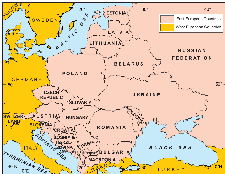
East Europe today

Please see the following websites for further information: