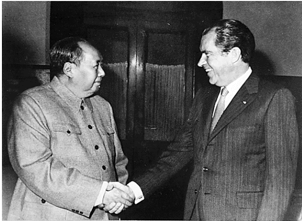
Chairman Mao Zedong and US President Richard Nixon (1972)

1949. President Richard Nixon visited China in 1972. Now, by visiting China in 1972, the United States had recognised the communist government of China. This was the first visit by an American President to China after China had become communist.