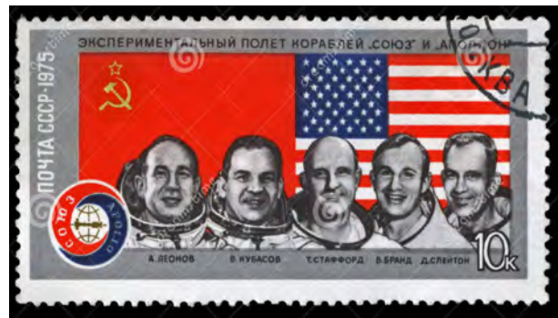
Postage Stamp celebrating the Apollo-Soyuz joint flight

President Jimmy Carter, Egyptian President Anwar el-Sadat and Israeli Prime Minister Menachem Begin signed a 'Framework for Peace for Middle East'. This meeting tried to reduce tensions between Israel and the Arab world.